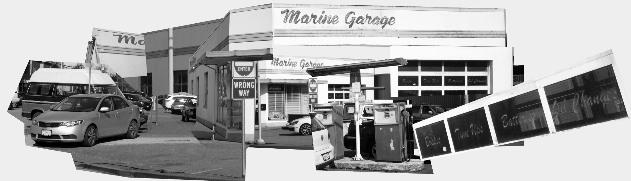
Abstraction 1 Path analysis + Composition